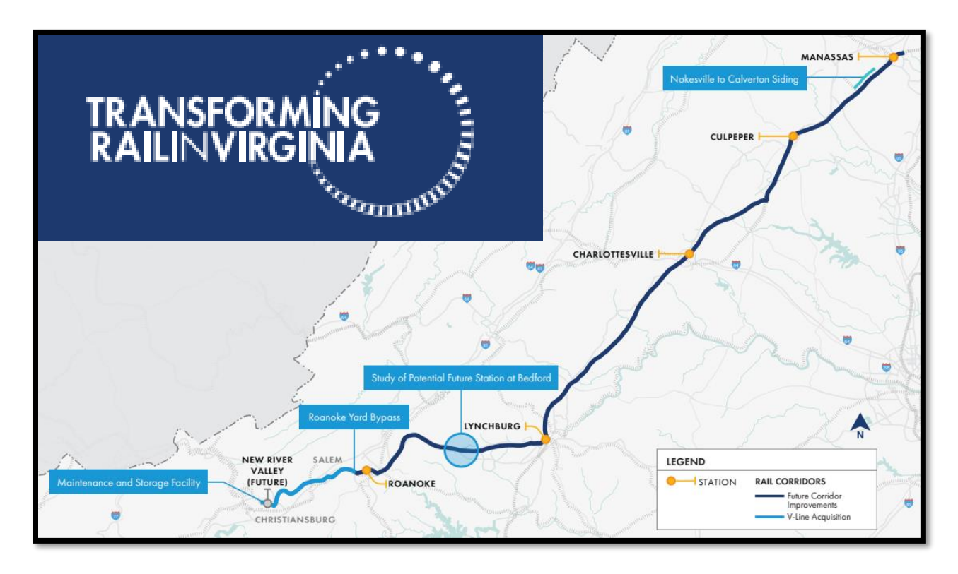
FIGURE 1: CORRIDOR MAP

The Transforming Rail in Virginia (Virginia-Norfolk Southern Railway Partnership) Map depicted in Figure 1 shows the location of a potential future station at Bedford, among other improvements in the corridor between Manassas and the New River Valley.